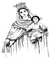
Our Lady of Mount Carmel

Let us pray that the measures of caution being asked of all of us keep us from harm and that our prayers help those affected by this devastating virus.